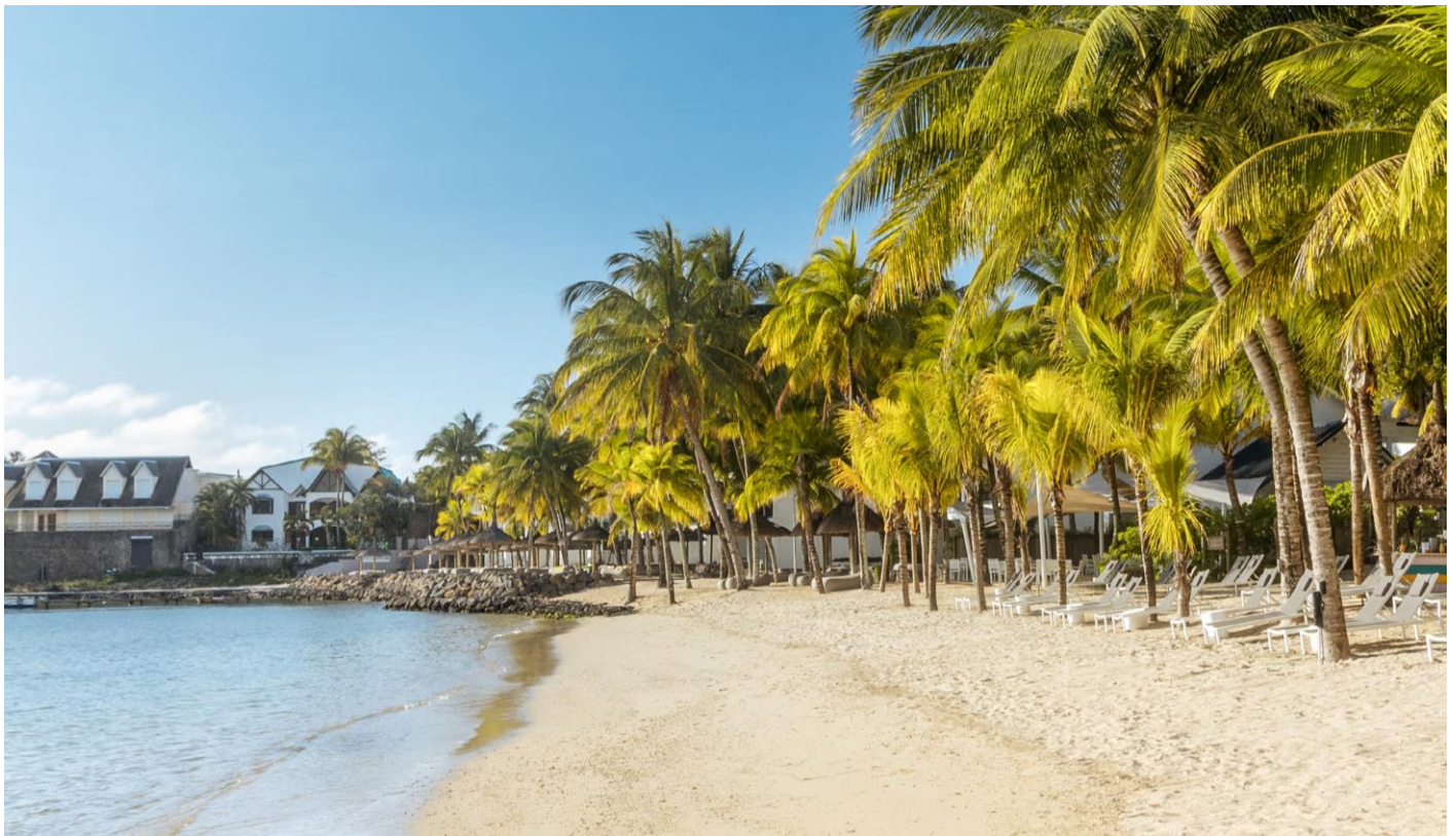
The Beach at The Ravenala Attitude Hotel, Turtle Bay, Balaclava, Mauritius