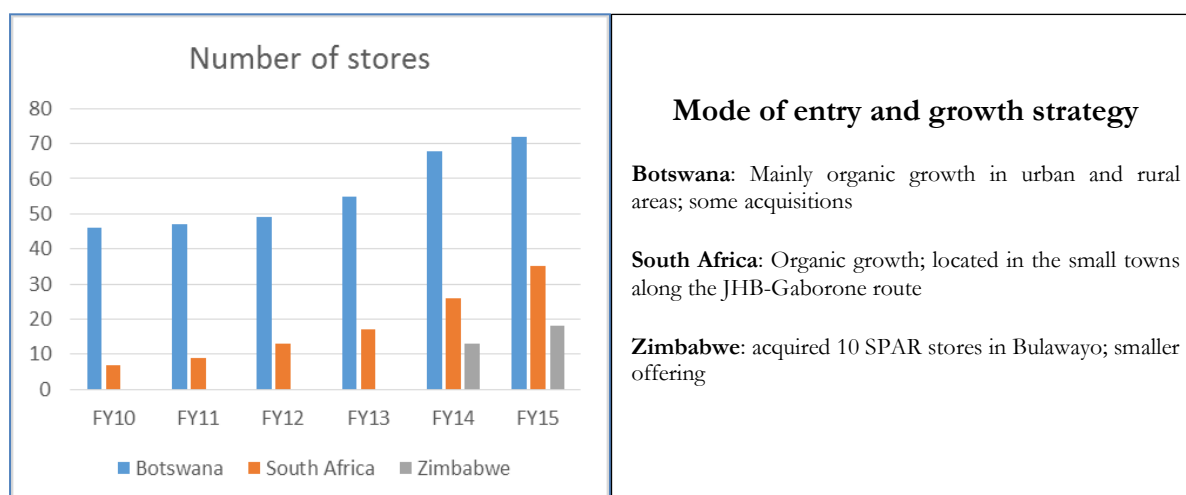
Figure 1: Growth of Choppies store numbers and mode of entry